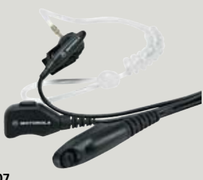
PLMN4607 Surveillance Kit with Clear Acoustic Earpiece

Motorola accessories are built with the highest quality standards and are specially engineered to ensure maximum performance for your radio, no matter what profession you're in.